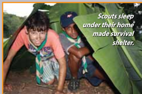
Scouts sleep under their home made survival shelter.